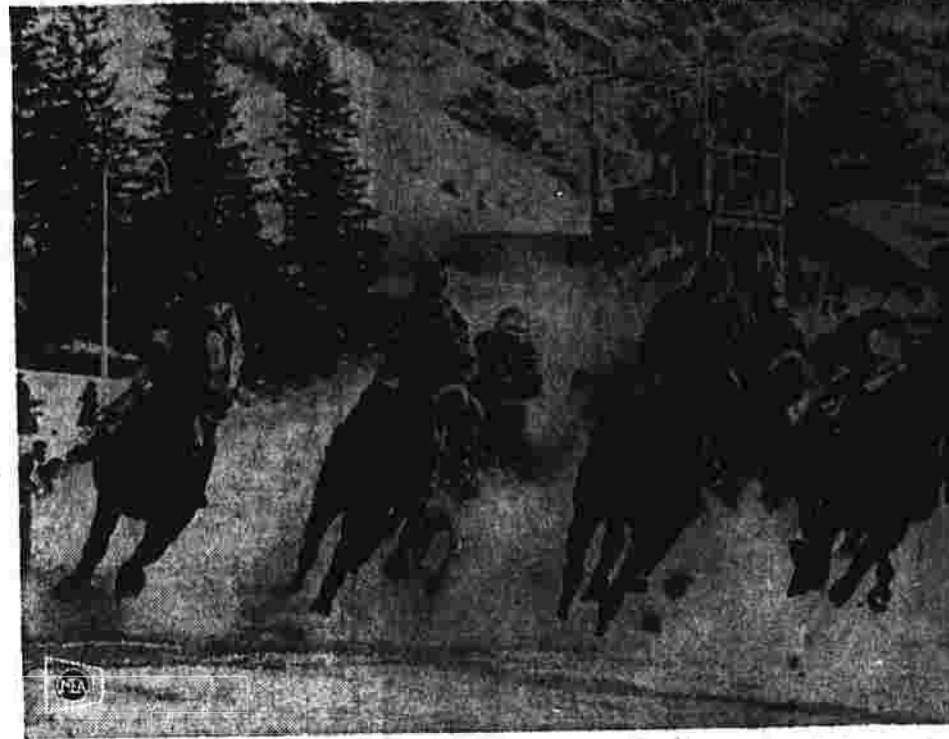
DASHING THROUGH THE SNOW—So the cold won't make their eyes water, Jockeys wear goggles in this 1,800-meter race in the snow at winter resort of Arosa in Switzerland.